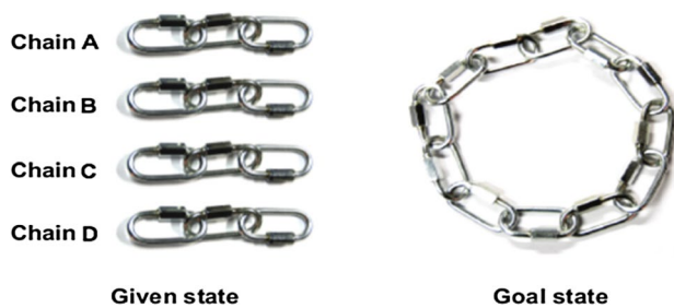
Fig. 1 Given and goal states in the cheap necklace problem

2007). The solution requires all the links in one chain to be opened at a cost of 6¢, then connecting the remaining three chains together using those open links, at a cost of 9¢. The solution to break up the chain with the aim of making a complete necklace is counterintuitive.